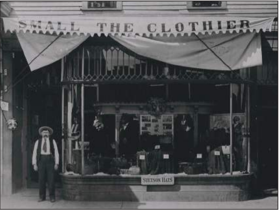
The changing store fronts of 506 State Street over the years.