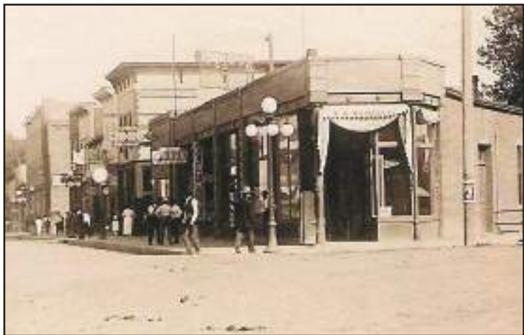
Looking east down State Street from 5 th Avenue. Small’s Clothier can be seen just left of center. The picture below shows what a similar angle looks like today.