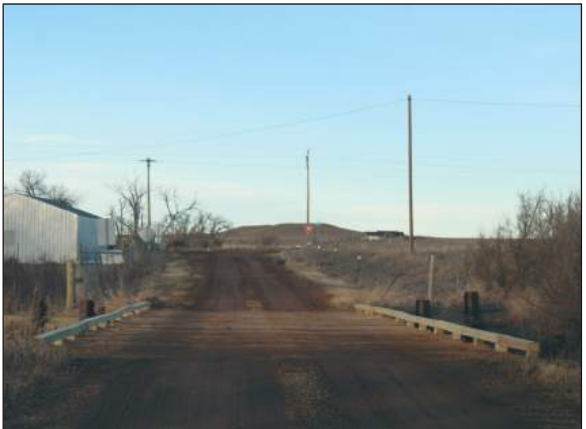
CHANGING OF THE GUARD RAILS - This bridge on Dillinger Road north of Highway 212, has had new guard rails put on the sides and will have planks covering the wear spots in the near future.

Heidrich said it would cost around $6,000 to re-deck the bridge on a minimal use bridge.