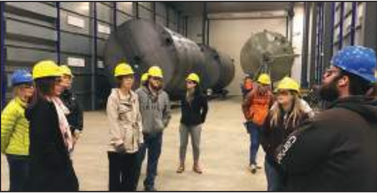
Leadership Belle Fourche Tour at Permian Tank Production Facility (above); Tour of Ring Container - safety ready for the tour! (below)