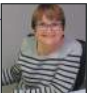
by Mary Buchholz

Belle Fourche bank debits in November did not reflect the dramatic gain they have shown for the past four months, but they did show an increase of three per cent. November debits amounted to $16,950,000 as compared to $16,499,000 in November of 1967. The total for the last 12 months stands at $136,465,000, an increase of 21 per cent over the previous 12 months period, while the January through November total stands at $123,854,000, an increase of 22 per cent over the same period a year ago.