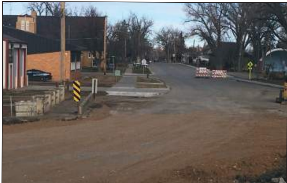
GO NORTH, GO SOUTH - On Friday Dec. 21 Heavy Constructors Inc., worked ferociously to clear 8th Avenue for the two week holiday break. For the first time since early this year you could drive on 8th Avenue from National Street to State Street. A nice Christmas present for anyone who lives along 8th. Road closed signs are still up as work will continue after the New Year, but traffic is steadily increasing on the new thoroughfare. Photos show north (left) and south (right) views across temporary crossing at the Hay Creek Bridge.